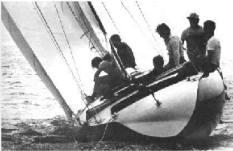
Cassiopea vincitrice della 25ª edizione della Centomiglia