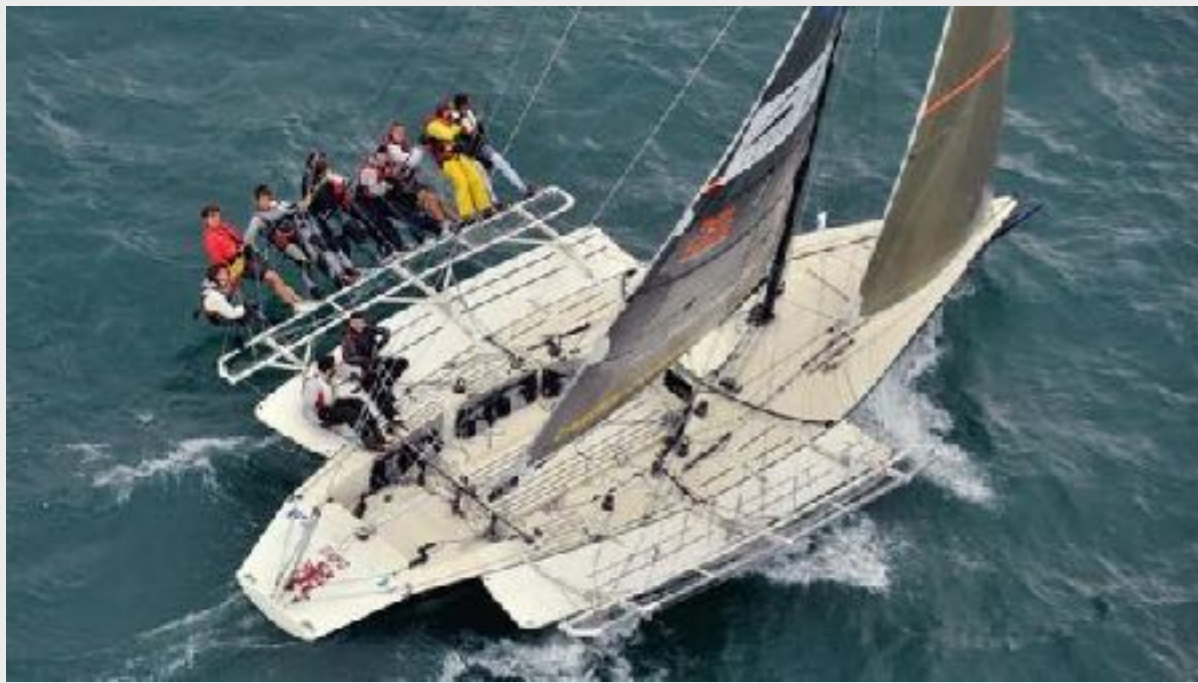
1980-2017: Classe Libera