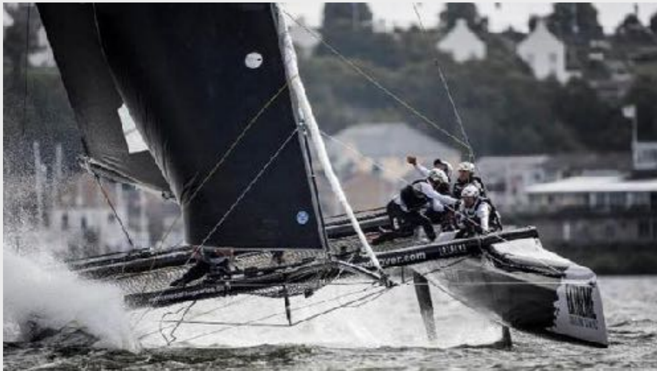
1980-2017: Multiscafo (Catamarans)