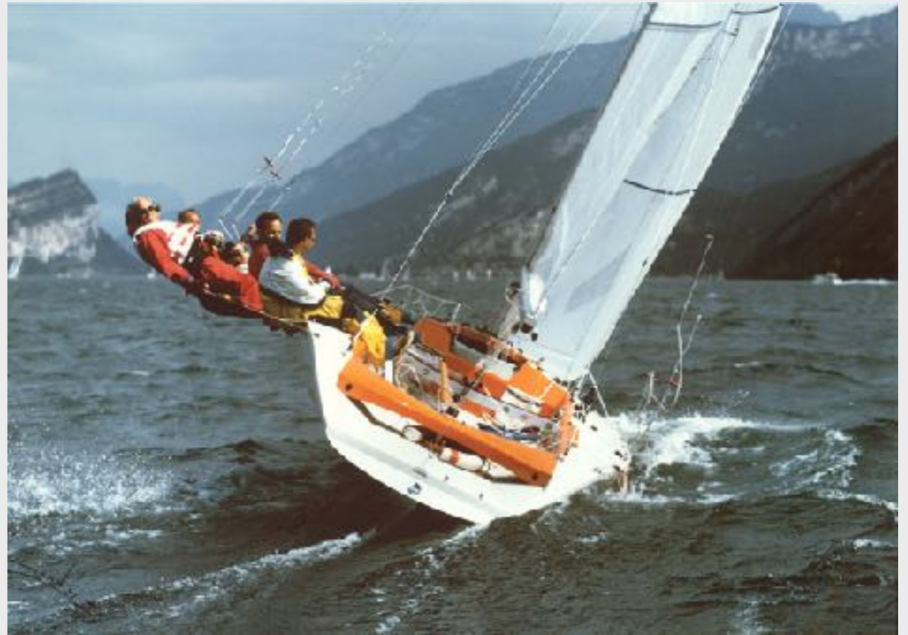
1980-2017: Classe Libera (Asso 99)