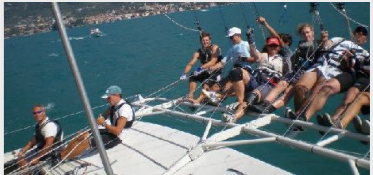
Grifo Zero 30, 1980